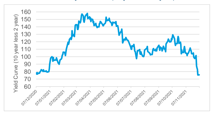
Chart of the week: US yield curve (10-year less 2-year)